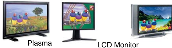
Plasma LCD Monitor